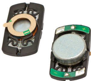
Ill. 1, Tectonic Elements Audio Exciter 14C02-8