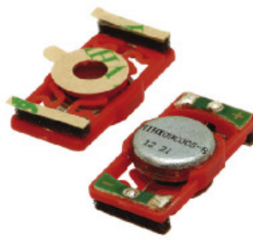
Ill. 2, HiWave Exciter 09C005-8